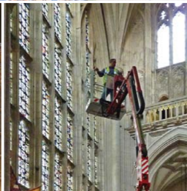
10. Cherry Picker