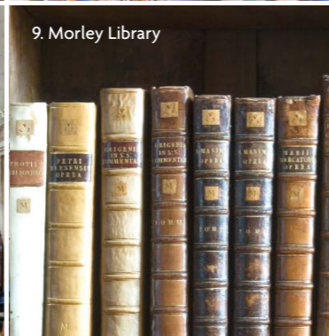
9. Morley Library