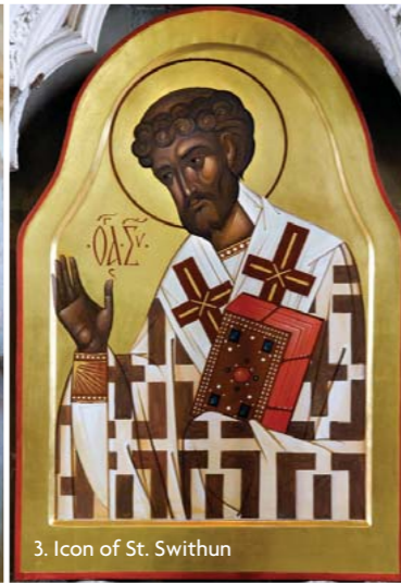
3. Icon of St. Swithun