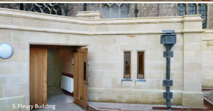
5. Fleury Building