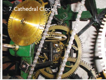
7. Cathedral Clock