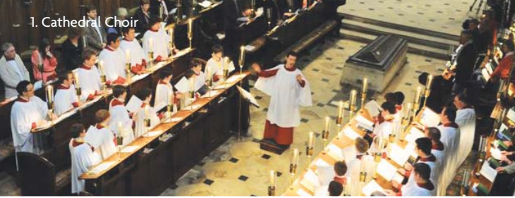
1. Cathedral Choir