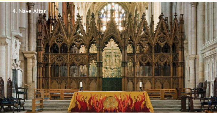
4. Nave Altar