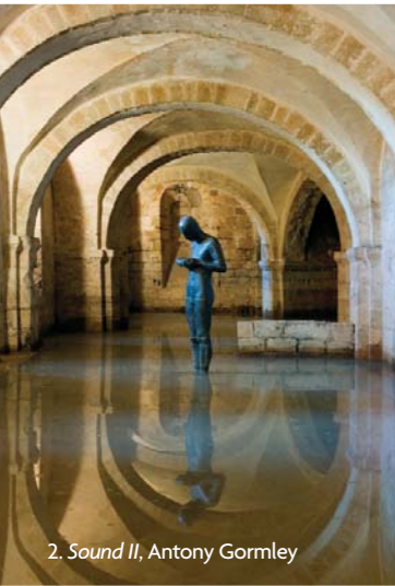
2. Sound II, Antony Gormley