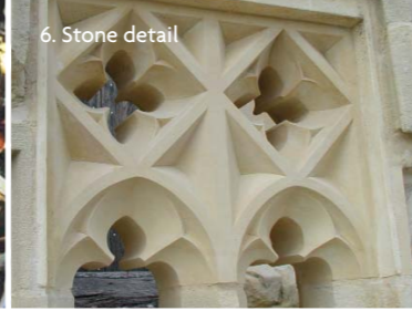
6. Stone detail